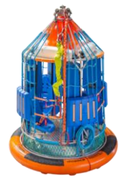
4 -Pax NORSOK

SAFETRANSFER® enables safe, quick and effective transfer between offshore installations, drilling rigs and vessels.